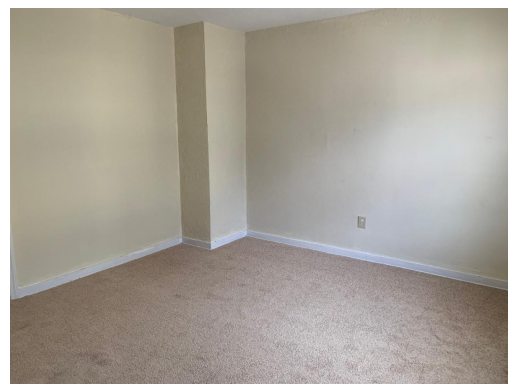
Interior of 1BR Apt